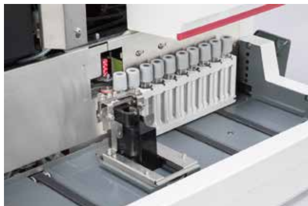
Identified as a set

Pair rack can have a barcode labeled-sample tube and a sample cup identified as a pair, contributing to safety aspects by preventing mix-up and streamlined work flow.