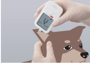
3. Draw blood.(0.3μl)