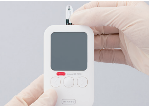
1. Insert a test strip.

A test strip can be ejected by sliding the test strip disposal lever located on the back of the meter.