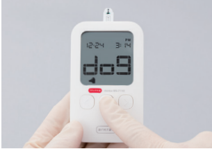
2. Select the animal type.