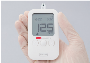
4. Test result appears after 5 seconds.

Measurement accuracy is enhanced by adding calibration curves for canine and feline.