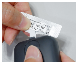
Dispose of the test strip using the opened foil packet