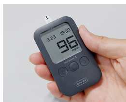
Blood glucose levels are then displayed