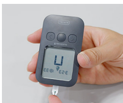
Apply a drop of blood and start the measurement