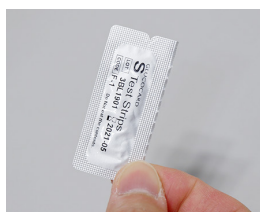
Use one foil packet