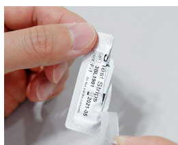
Tear the foil packet from the notch