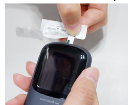
Insert the test strip into the meter's slot