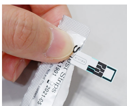
Take the test strip out of the foil packet